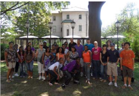
Randolph Henry students take a tour of the VCU campus in Richmond.