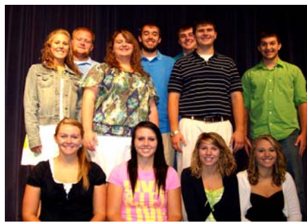
Eleven seniors—all GEAR UP students—are the leaders of the Northwood High School Student Council Association.