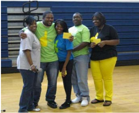
Sussex students participated in a College 101 Preparation workshop.