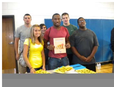
GEAR UP students at Gretna High attended a College Fair with more than 60 colleges and universities participating.