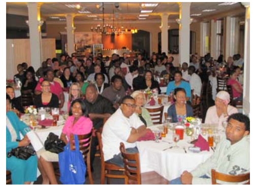
GEAR UP students and parents from E.C. Glass and Heritage participated in an end-of-year dinner celebration.