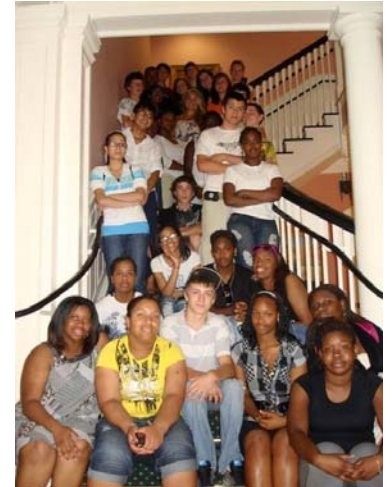
Nottoway GEAR UP students visited Longwood University.