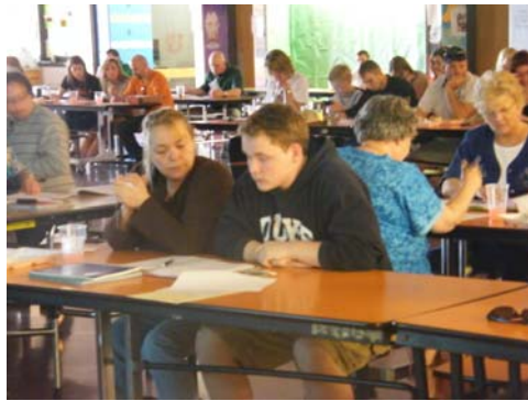
Pulaski GEAR UP students and parents attend Next Steps to College meeting.